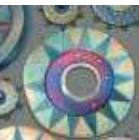
Jewellery at Pateley Bridge