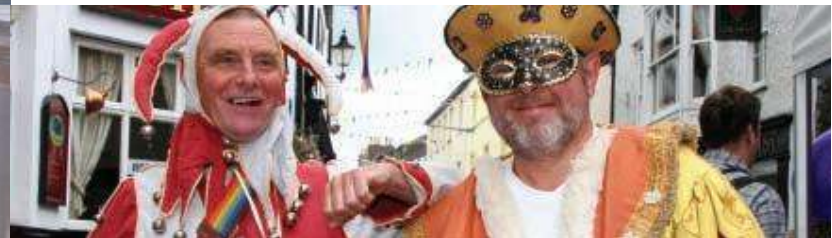
Medieval Fayre, Sedburgh