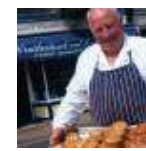
H. Weatherhead & Sons, Pateley Bridge