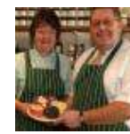
The Deli, Ripon