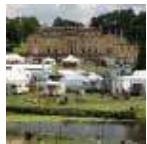
Broughton Game Show