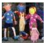
Scarecrow Festival, Kettlewell