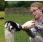
Holme Open Farm