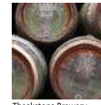
Theakstons Brewery, Masham