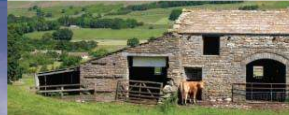
Barn in Wensleydale